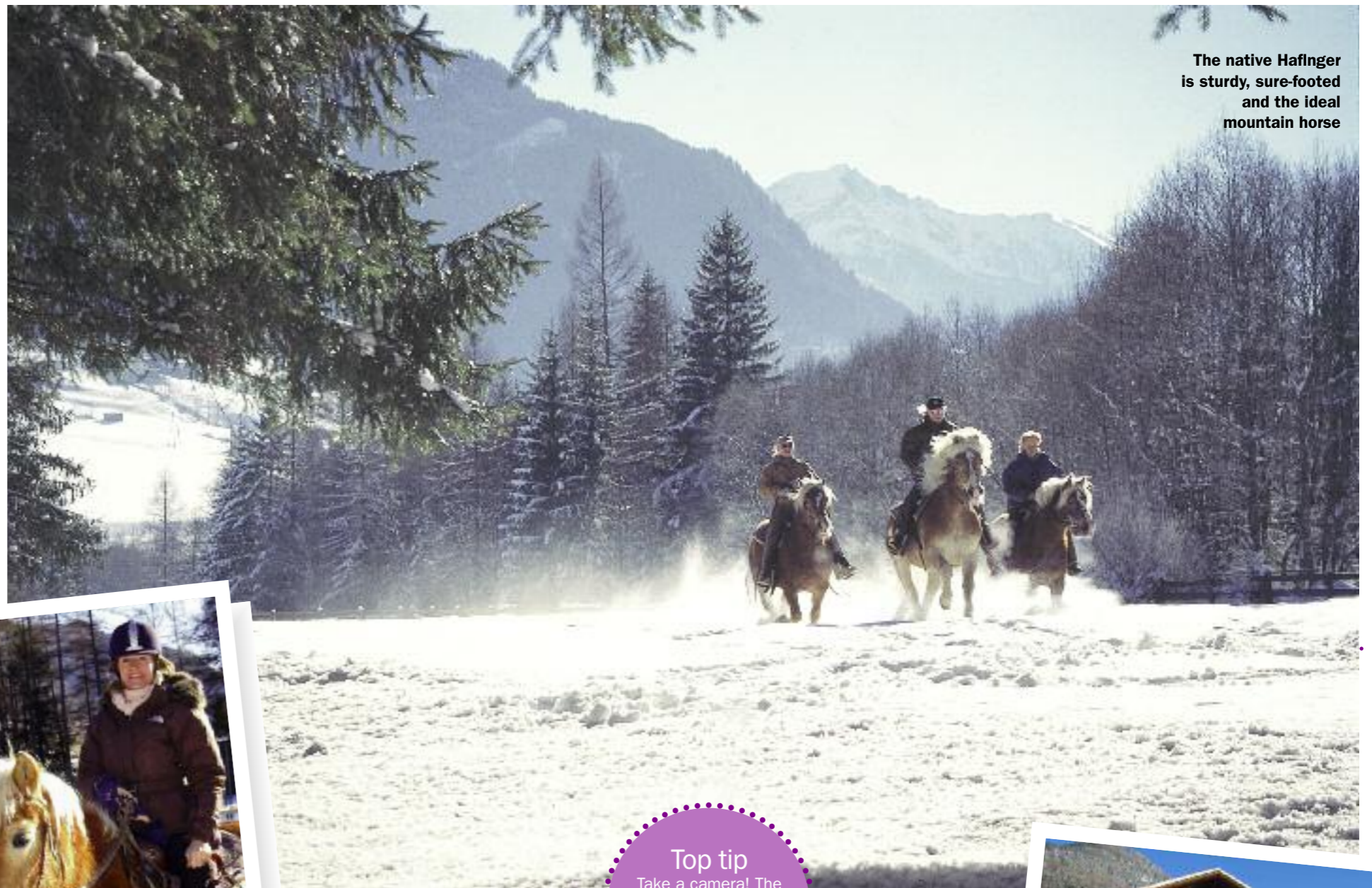
The native Haflinger is sturdy, sure-footed and the ideal mountain horse

Call ☎ 020 7917 9880 or visit www.theridingcompany.com