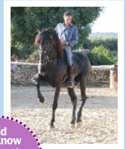
The Menorcan horses are real head-turners

Did you know That Menorca has more horses per metre square than anywhere else in Europe?