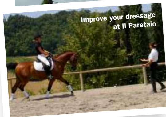
Improve your dressage at Il Parettaio

Contact Il Parettaio on ☎ 00 39 055 8059-218 or visit www.ilparetaio.it