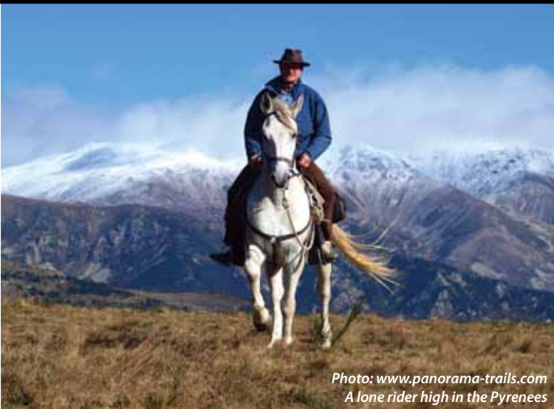
A lone rider high in the Pyrenees

Follow in the steps of Spanish herdsmen who drive cattle along the romantically named El Camino Real (less romantically translated as the Royal Road or King's Highway). Ride through the soft, round hills that are such a startling contrast to the wild and bizarre rock formations of the Garrotxa Mountains. Panorama Trail's aptly-named Trail of Bandits traces the footsteps of 17th Century Spain's infamous bandolero Joan Sala Serrallonga who roamed the mountains of Guillerries and Garrotxa and disappeared into vast, pathless areas of woodland that offered him good places to hide from the law. Under Catalan blue skies, ride other trails through breathtakingly beautiful canyons, up table mountains and volcanoes and beside rivers, lakes and waterfalls. With Unicorn Trails, experience how people actually travelled in 19th Century Spain in an almost forgotten region of Andalusia called the Alpujarra Mountains. Try to keep your eyes open as you ride impossibly steep donkey trails that lead from one whitewashed village clinging to a precipitous mountain slope to the next tiny village on an even more terrifying incline.