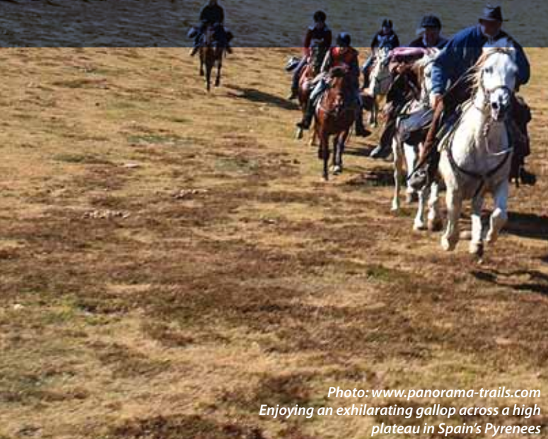
Enjoying an exhilarating gallop across a high plateau in Spain's Pyrenees