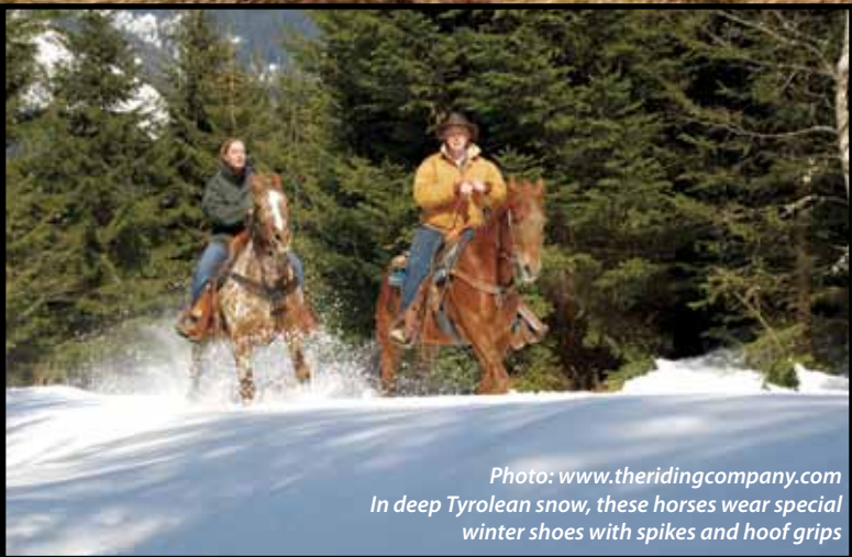
In deep Tyrolean snow, these horses wear special winter shoes with spikes and hoof grips